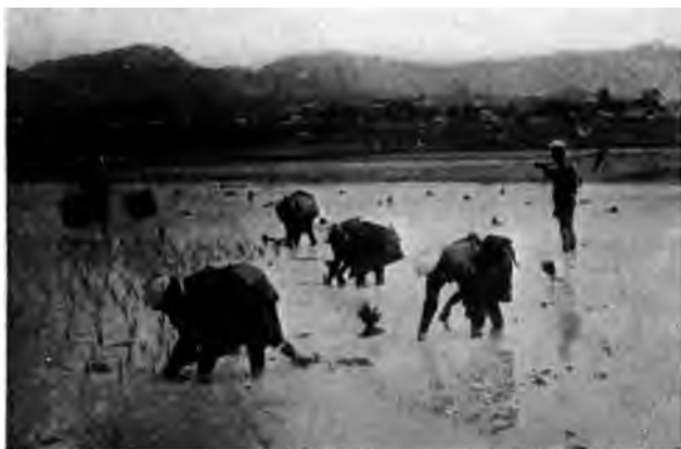
A FAMILY AT WORK IN A RICE-FIELD TRANSPLANTING YOUNG RICE PLANTS